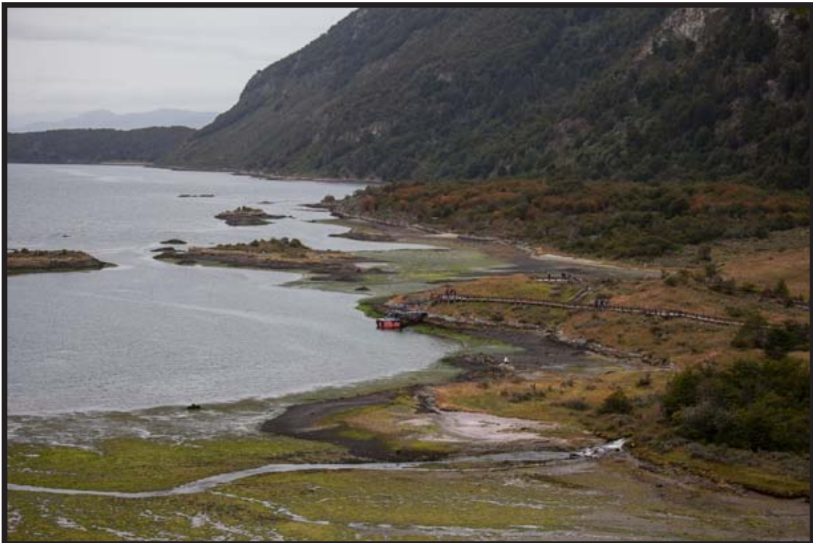
The end of the Pan-American highway in Tierra del Fuego National Park. 17,848 Km from Alaska.