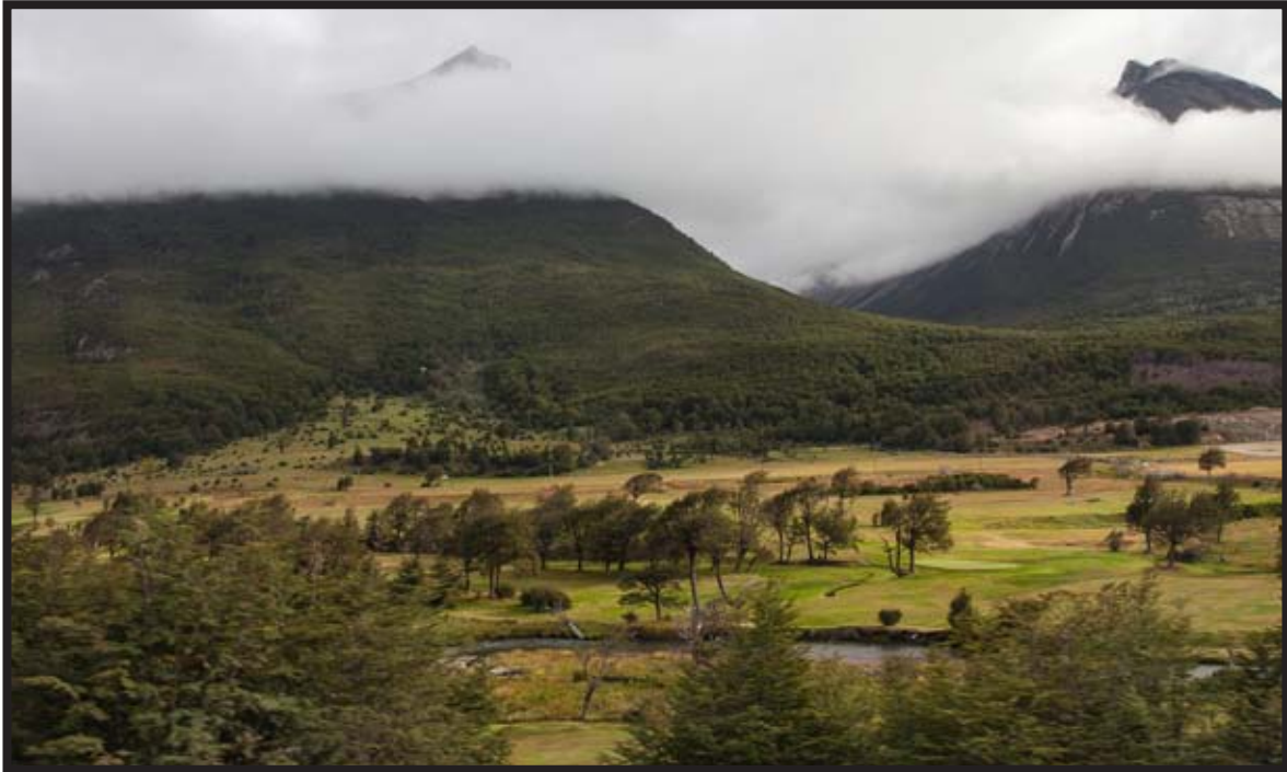
On our way to the end of the Pan-American highway we passed the southern most golf course in the world (albeit 9 holes, played twice for 18). Being on a tour it was not destined for me to get to play there.